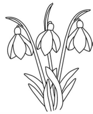
The snowdrops are now flowering in our church garden—take a look!